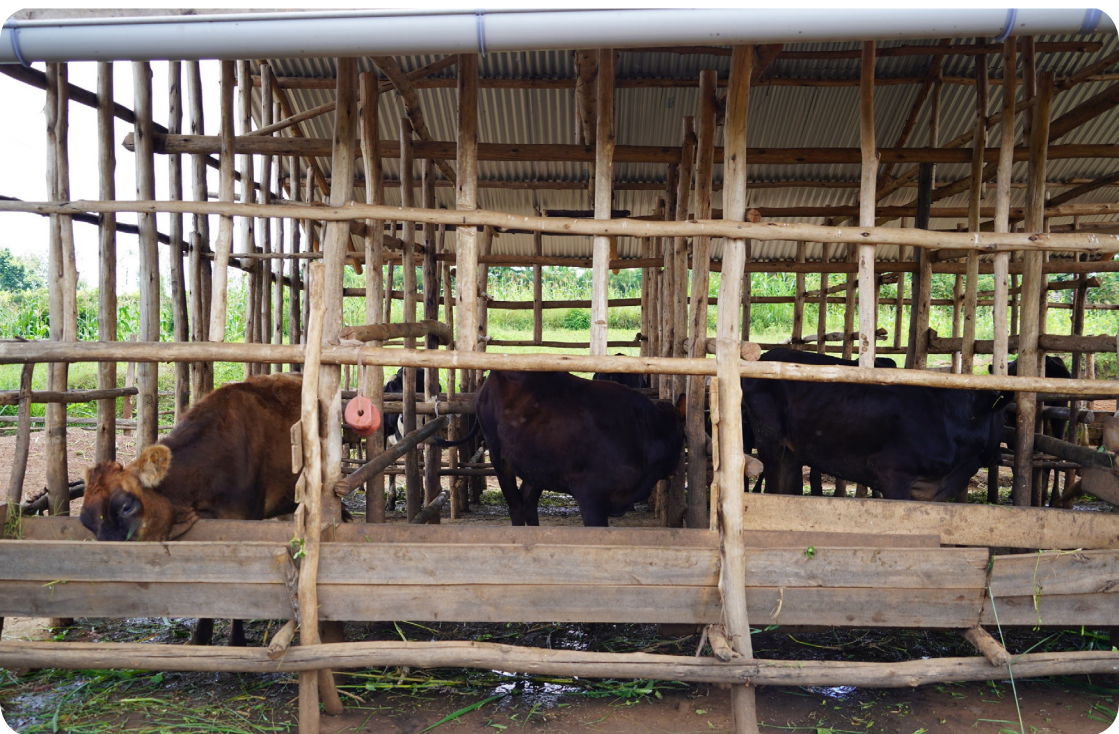
A collective cowshed built for a cooperative as it prepares to develop a biogas production business in Bugesera district, Rwanda;

of big gas production stations which can sell packaged biogas to households who would then only have to install compatible cooking stoves and buy 1 or 2 mobile biogas backpacks. This would greatly reduce the upfront cost to switching from firewood to biogas and avoid the recurrent maintenance costs required for households-based digesters.