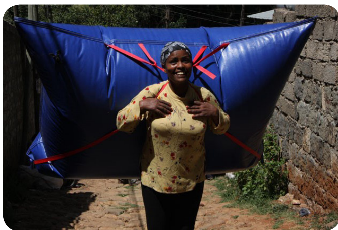
woman carrying a biogas back from a biogas seller in Ethiopia

Indeed, the government has done its due share through funding the research on best models of bio-digesters suitable to local conditions. It has also thought about the capacity development, training technicians and entrepreneurs, social marketing and