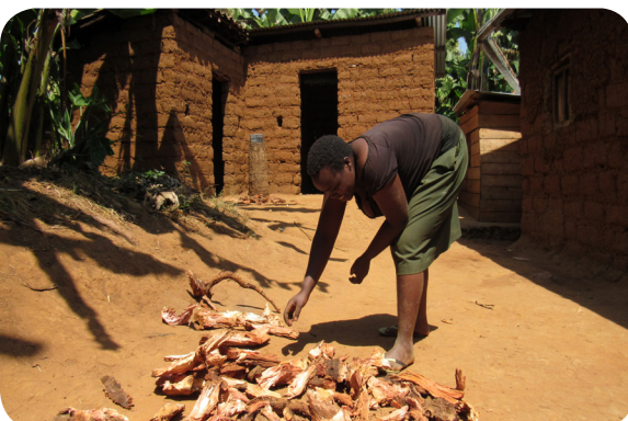
A woman in Bugesera putting firewood from tree stump to dry in sun

So far, 76 households have benefited from the scheme and have digesters installed as well. Having only 76 out of thousands of households that surrounds Mukura forest switch from using firewood to biogas for cooking is not going to have a big impact in terms of reduction of pressure on the forest. However, this has served as a proof of concept which further awareness and sensitization effort on sustainable energy will build on.