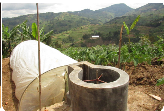
A Canvas-type biogas digester under construction in Rutsiro District, Rwanda