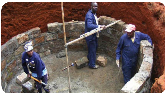
The installation of biogas plant. The cost is generally beyond the means of many poor.

Biogas in particular faces a set of unique and different challenges since there exist a variety of constraints to the provision of biogas digesters. These include the fact that their market absorption capacity is constrained by the low purchasing power of households despite the various financing options and incentives that have been put in place. Moreover, there is a lack of information and standards to allow better targeting and prevent digesters breaking down and more training is required to increase mason numbers and ensure effective maintenance.