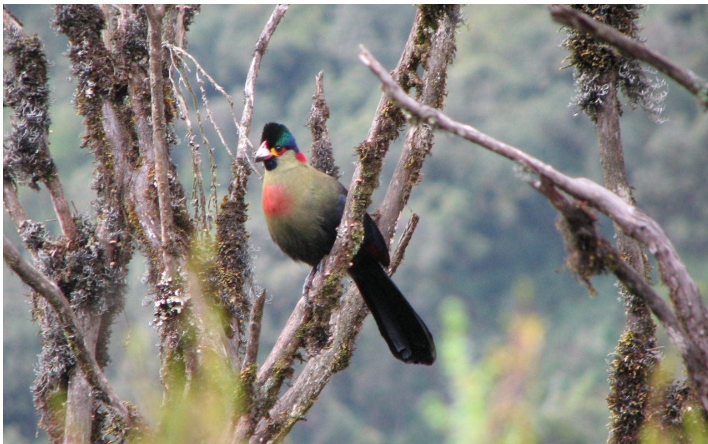
Rwenzori Turaco (ARCOS Logo) in Rwenzori Mountains National Park, Endemic species constitute one of the focal areas for data mobilization in the region and ARCOS puts much effort in closing such data gaps by supporting field data collection in key landscapes, Date: 2007.

Visit ARBIMS at: http://arbims.arcosnetwork.org