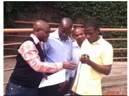
CGIS Staff training biodiversity practitioners on the use of GPS.

This is a very welcome development in environmental sciences where funding is always scarce and the Albertine Rift Biodiversity Data Mobilization project seeks to pilot this approach as solution to biodiversity data availability in the region.