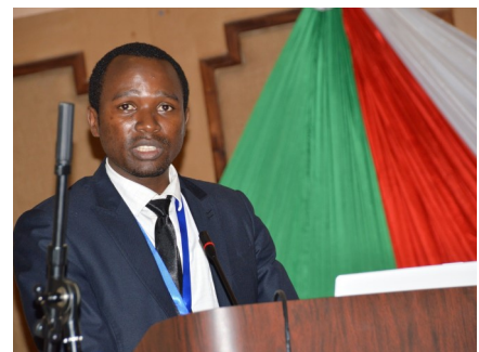
ARCOS staff presenting about ARBIMS during its launch at the Africa Regional Mountain Forum, 2014.