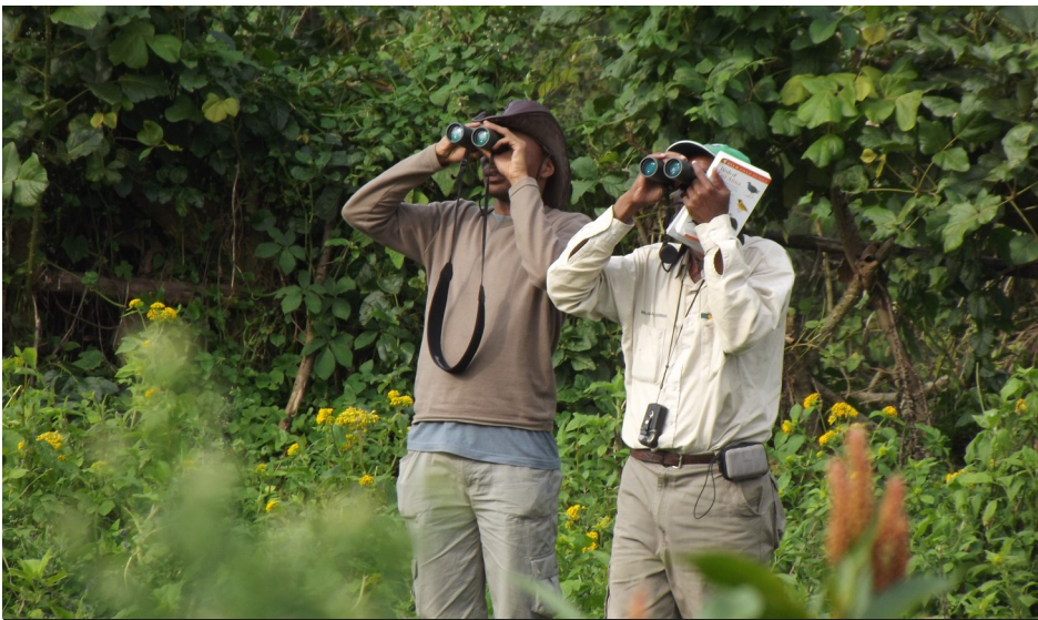
ARCOS Team conducting Bird Surveys in Echuya Forest, Uganda. Through its Integrated Landscape Assessment and Monitoring (ILAM) programme, ARCOS conducts regular biodiversity surveys in its focal landscapes. April 2013