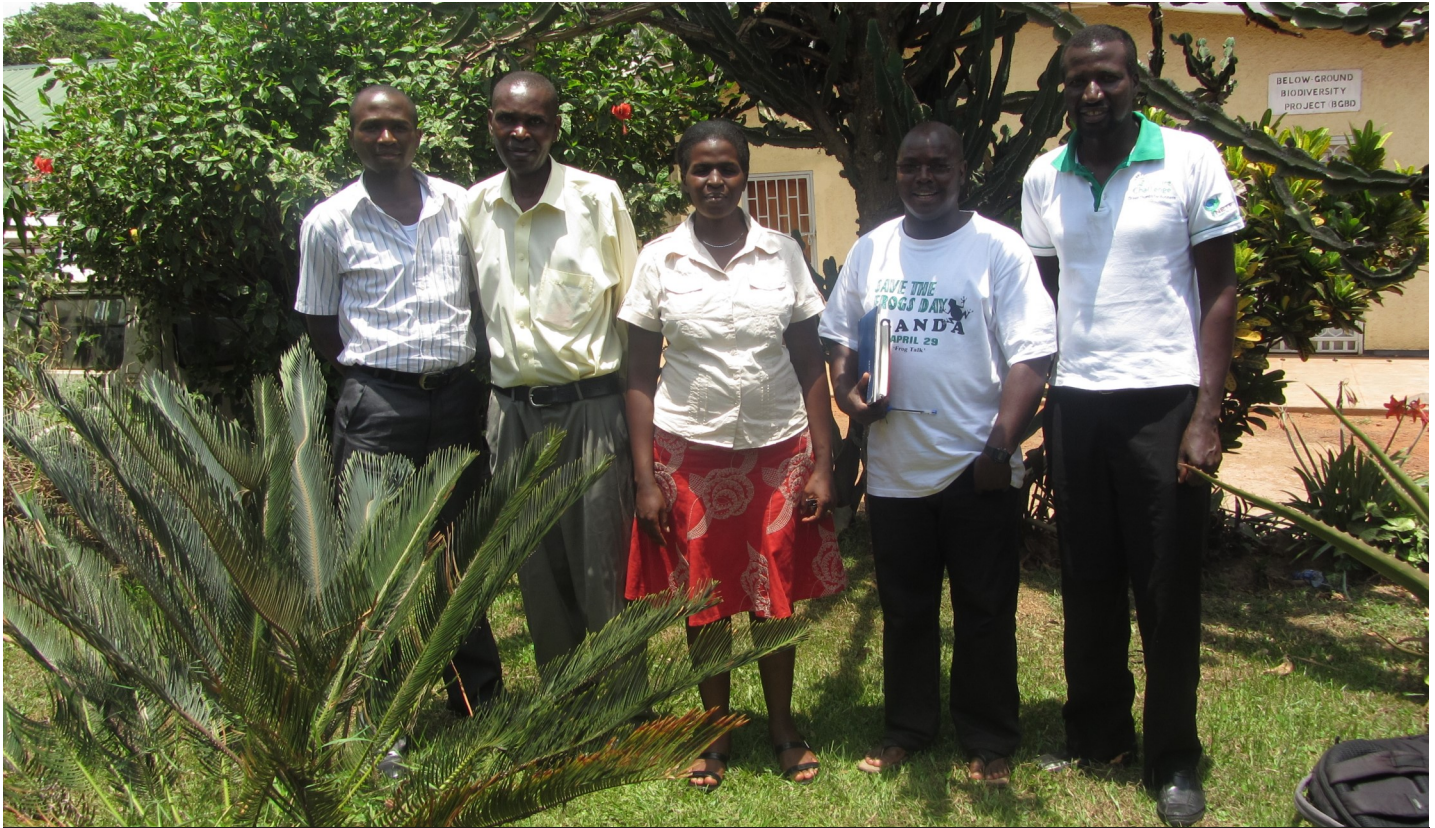
ARCOS team visiting National Biodiversity Data Bank of Makerere University. NBDB is one of the project's implementing partners and has been participating in ARBIMS activities since its development stage in 2009.